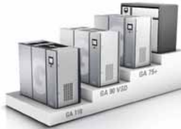
Temporary priority sequence