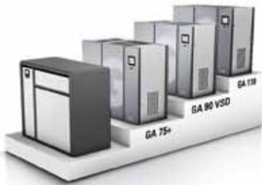
Normal priority sequence