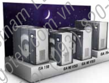
Nighttime priority settings

ES can prioritize machines in an installation to find the most economically efficient way to suit different workload demands in different periods.