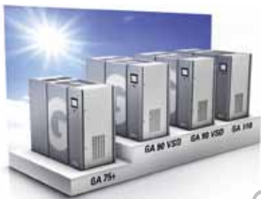
Daytime priority settings

ES can prioritize machines in an installation to find the most economically efficient way to suit different workload demands in different periods.